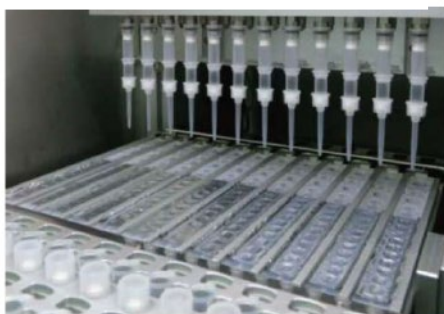
*QuickGene - Auto 12S